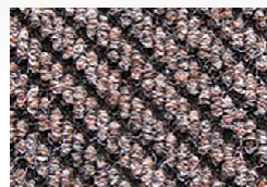
04. Pebble 1514