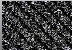
09. Anthracite 1593