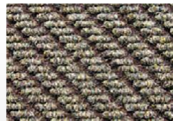
06. Olive 1594