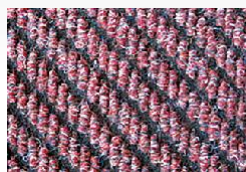
01. Cranberry 1598