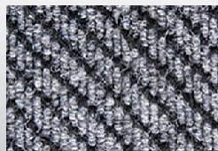
10. Mid Grey 1512