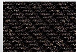
08. Black Shadow 2343